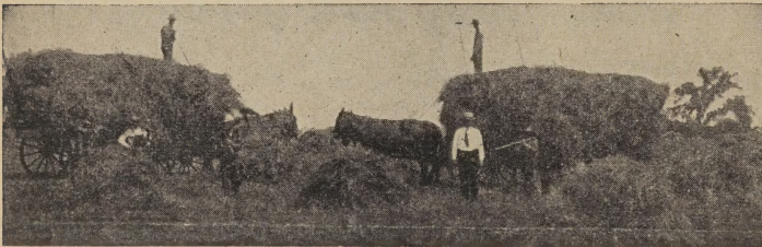
Wood's Tested Seeds Always Make Dependable Crops

WOOD'S HIGH-GRADE SHEEP MANURE. 25 lbs., 85c.; 50 lbs., $1.50; 100 lbs., $2.65.